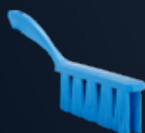
UST Bench Brush, Soft Art. no: 4581x