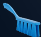
UST Bench Brush, Medium Art. no: 4585x